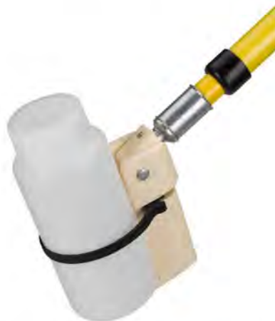
Figure 1: Illustration of in-pipe grab sample collection technique by pole sampling.